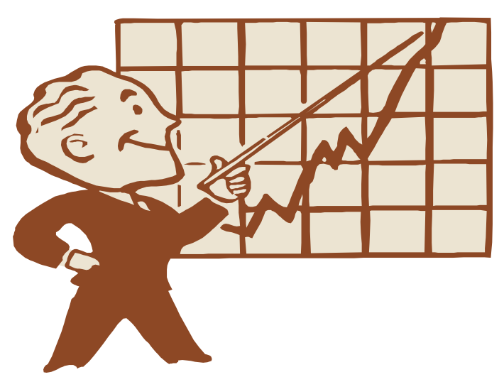
Visual Aids can greatly enhance your presentation and help your listeners with retention.

There are several other services worth investigating if you want to increase the potential profitability of your Teleseminar. These are, of course, optional, but any combination of these tools has the potential to bring your presentation to life and give it more flair. Some of these methods have already been discussed, but their importance is so high that their use cannot be overstressed.