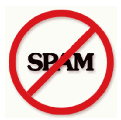
Never SPAM; it's a one-way ticket to nowhere and will do your business more harm than good.

product or service. Following what others with a similar product or service do will assist you in perfecting your personal marketing concepts.