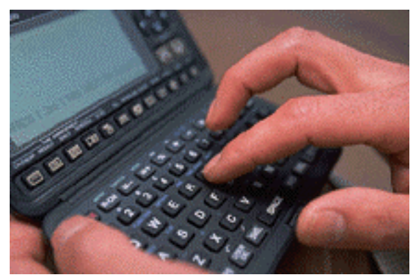
Changes in technology have made Teleseminars the wave of the future.

The old saying "time is money" is appropriate in this kind of business because you want to present a topic that is going to be of interest in as short a period of time as possible. Your audience is going to tire of hearing you simply fill in time; they want you to say what you need to say and close.